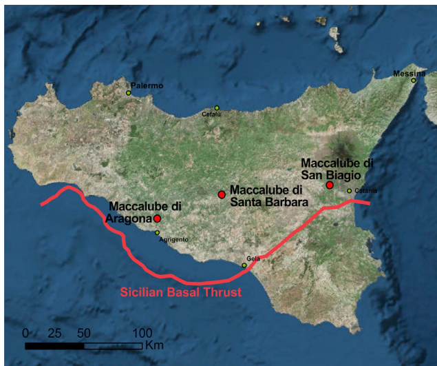
Fig. 1 - Geographic overview of mud vulcano in Sicily (red point) and of the Sicilian Basal Thrust (red line).

It is possible to find out from the observation and interpretation of every single Strahler