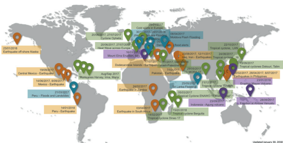
Fig. 3 - Map showing all the emergency activations during the 1-year operation of ARISTOTLE (Feb. 2017 - Jan. 2018). A total of 43 activations of the system were made by ERCC. [Earthquakes and tsunamis (orange); Volcanos (deep purple); Severe Weather (green); Floods (light blue)].