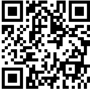
Lines 10 e S